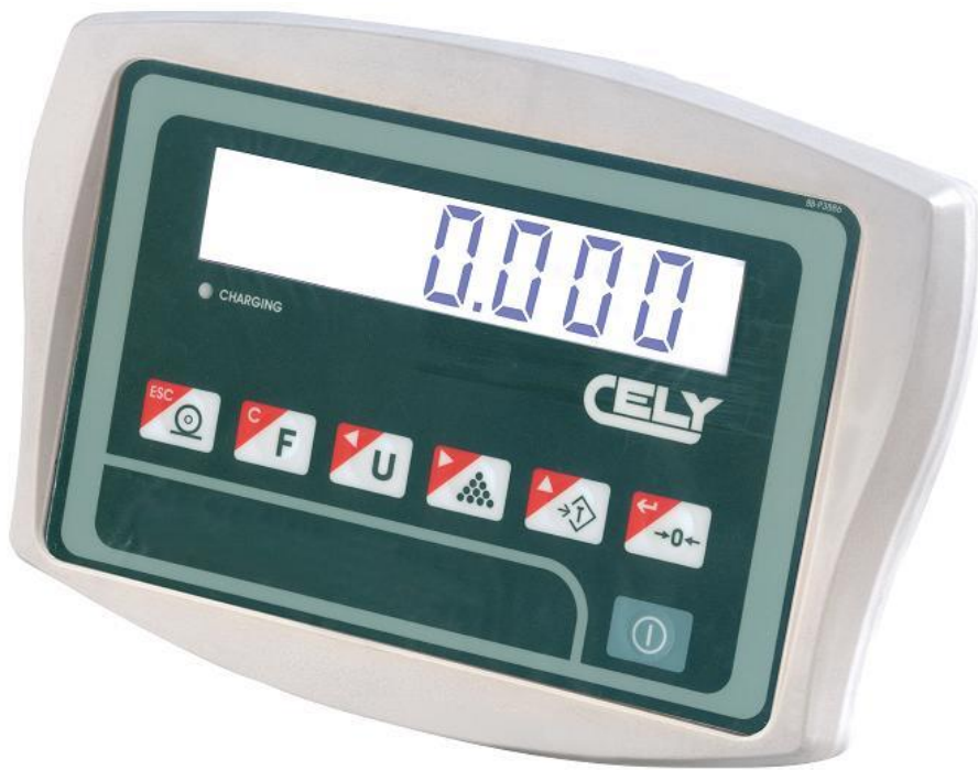
Figure 5 VC50 indicator.