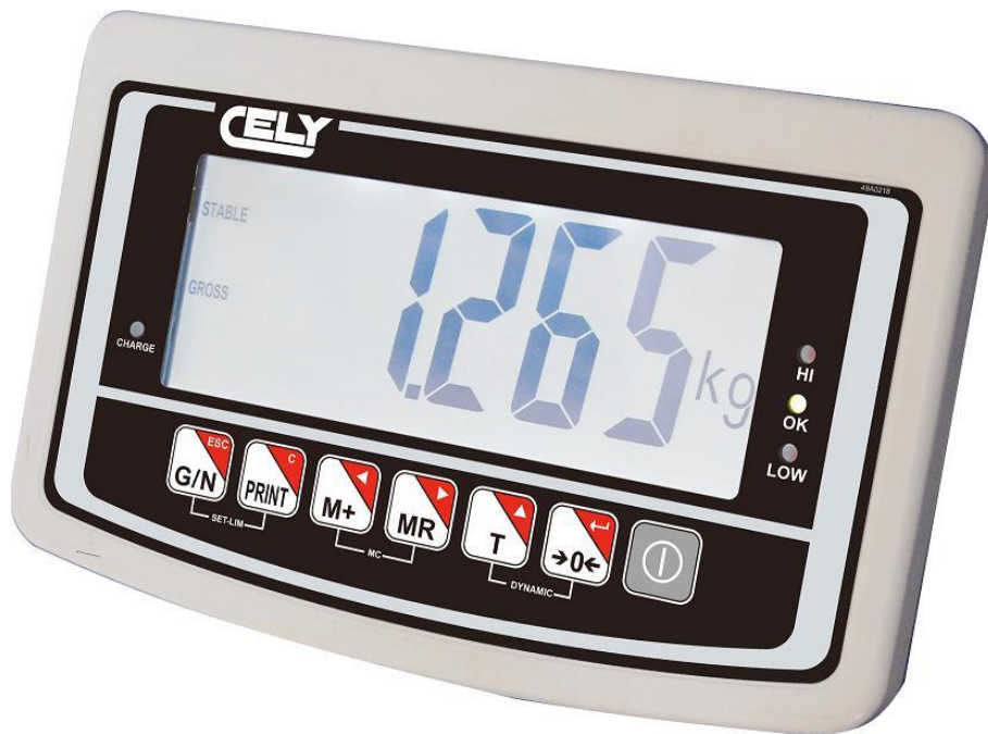
Figure 3 VC45 indicator.