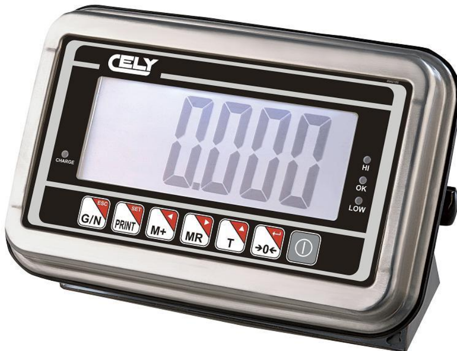
Figure 2 VC80I indicator.