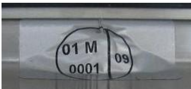
Figure 6 Example of sealing of VC80 / VC80I / VC70 / VC50.