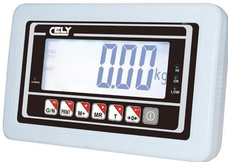
Figure 4 VC70 indicator.