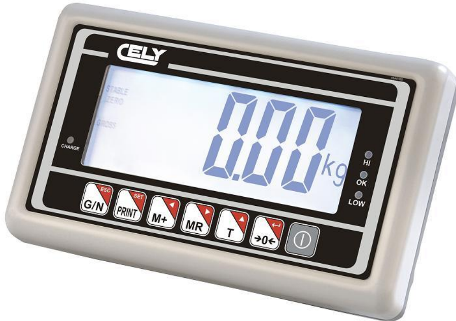
Figure 1 VC80 indicator.